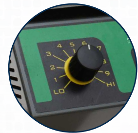
10 Heat Settings Temperature Range: 200-450 C