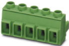
The illustration shows the 5-position version of the product

Plug component, Nominal current: 16 A, Rated voltage (III/2): 1000 V, Number of positions: 3, Pitch: 7.62 mm, Connection method: Screw connection, Color: green, Contact surface: Tin