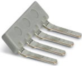
Insertion bridge for plugs featuring a screw connection with a 3.81 mm pitch

Please be informed that the data shown in this PDF Document is generated from our Online Catalog. Please find the complete data in the user's documentation. Our General Terms of Use for Downloads are valid ( http://phoenixcontact.com/download )