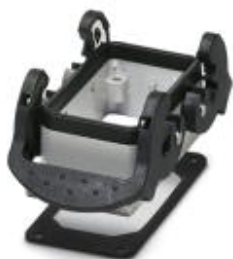
HEAVYCON B10 panel mounting base, with double locking latch, height: 29 mm, with flat gasket

Please be informed that the data shown in this PDF Document is generated from our Online Catalog. Please find the complete data in the user's documentation. Our General Terms of Use for Downloads are valid ( http://phoenixcontact.com/download )