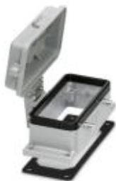
HEAVYCON B16 panel mounting base, for double locking latch, height: 29 mm, with plastic cover, with flat gasket

Please be informed that the data shown in this PDF Document is generated from our Online Catalog. Please find the complete data in the user's documentation. Our General Terms of Use for Downloads are valid ( http://phoenixcontact.com/download )