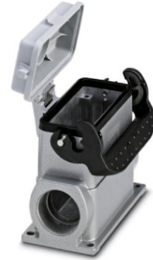
Figure shows product variant without screw connection

http://eshop.phoenixcontact.de/phoenix/treeViewClick.do?UID=1771697