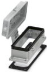
HEAVYCON B24 panel mounting base, for double locking latch, height: 29 mm, with plastic cover, with flat gasket

Please be informed that the data shown in this PDF Document is generated from our Online Catalog. Please find the complete data in the user's documentation. Our General Terms of Use for Downloads are valid ( http://phoenixcontact.com/download )