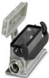
Box mounting base, with single locking latch, height 67 mm, with screw connection, 2x Pg21, with protective covers

Please be informed that the data shown in this PDF Document is generated from our Online Catalog. Please find the complete data in the user's documentation. Our General Terms of Use for Downloads are valid ( http://phoenixcontact.com/download )