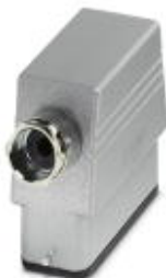
Sleeve housing, for single locking latch, height 72 mm, with screw connection, 1x Pg16, lateral cable entry

Please be informed that the data shown in this PDF Document is generated from our Online Catalog. Please find the complete data in the user's documentation. Our General Terms of Use for Downloads are valid ( http://phoenixcontact.com/download )