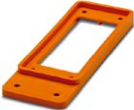
The illustration shows version HC-B 24-ADP-B 16, in orange

Adapter plates, from type to type, for HEAVYCON wall cutouts, cutout 36 x 65 mm, for type B24 to B10