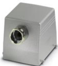
Sleeve housing, for double locking latch, height 80 mm, with screw connection, 1x Pg29, lateral cable entry

Please be informed that the data shown in this PDF Document is generated from our Online Catalog. Please find the complete data in the user's documentation. Our General Terms of Use for Downloads are valid ( http://phoenixcontact.com/download )