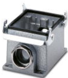
Box mounting base, with double locking latch, height 72 mm, with screw connection, 1x Pg29

Please be informed that the data shown in this PDF Document is generated from our Online Catalog. Please find the complete data in the user's documentation. Our General Terms of Use for Downloads are valid ( http://phoenixcontact.com/download )