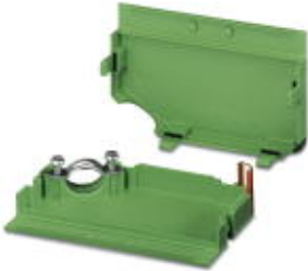
Cable housing, Pitch: 0 mm, Number of positions: 9, Dimension a: 45 mm, Color: green

Please be informed that the data shown in this PDF Document is generated from our Online Catalog. Please find the complete data in the user's documentation. Our General Terms of Use for Downloads are valid ( http://download.phoenixcontact.com )