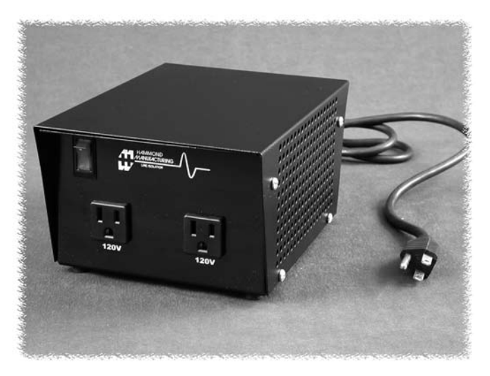
LINE ISOLATION STEP DOWN - PLUG IN