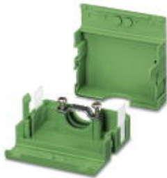
Cable housing, Pitch: 0 mm, Number of positions: 7, Dimension a: 35 mm, Color: green

Please be informed that the data shown in this PDF Document is generated from our Online Catalog. Please find the complete data in the user's documentation. Our General Terms of Use for Downloads are valid ( http://download.phoenixcontact.com )