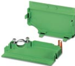
Cable housing, Pitch: 5 mm, Number of positions: 20, Dimension a: 100 mm, Color: green

Please be informed that the data shown in this PDF Document is generated from our Online Catalog. Please find the complete data in the user's documentation. Our General Terms of Use for Downloads are valid ( http://download.phoenixcontact.com )