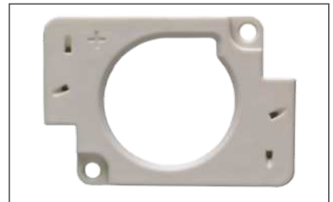
LED Array Holder for CREE* XLamp† CXA2520, CXA2530 and CXA2540 (Series 180720) Rectangular Version