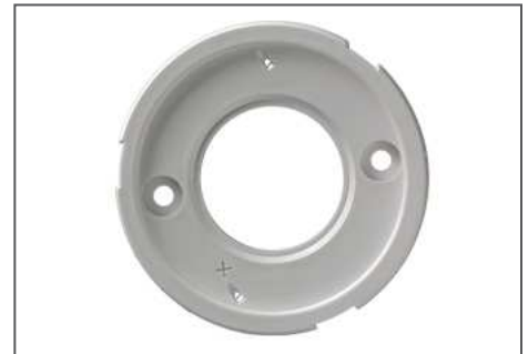
LED Array Holder for CREE* XLamp† CXA2520, CXA2530 and CXA2540 (Series 180810) Round Version