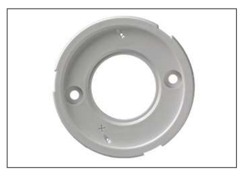
LED Array Holder for CREE* XLamp† CXA2520, CXA2530 and CXA2540 (Series 180810) Round Version