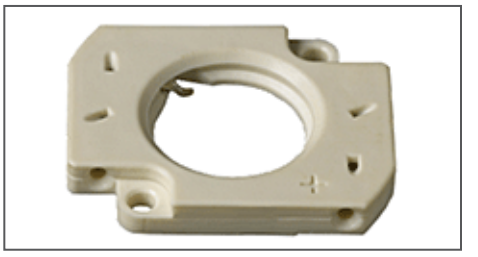
LED Array Holder for CREE* XLamp† CXA1507 and CXA1512 (Series 180560) Rectangular Version