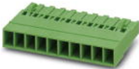
The illustration shows a 15-position version

Please be informed that the data shown in this PDF Document is generated from our Online Catalog. Please find the complete data in the user's documentation. Our General Terms of Use for Downloads are valid ( http://download.phoenixcontact.com )