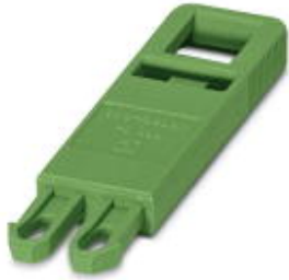
Strain relief for snapping into the latching chambers of the plug components, 2-pos., labeling with ZB 6

Please be informed that the data shown in this PDF Document is generated from our Online Catalog. Please find the complete data in the user's documentation. Our General Terms of Use for Downloads are valid ( http://phoenixcontact.com/download )