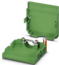
Cable housing, Pitch: 3.81 mm, Number of positions: 9, Dimension a: 36.68 mm, Color: green

Please be informed that the data shown in this PDF Document is generated from our Online Catalog. Please find the complete data in the user's documentation. Our General Terms of Use for Downloads are valid ( http://download.phoenixcontact.com )