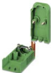
Cable housing, pitch: 0 mm, number of positions: 3, dimension a: 24.66 mm, color: green

Please be informed that the data shown in this PDF Document is generated from our Online Catalog. Please find the complete data in the user's documentation. Our General Terms of Use for Downloads are valid ( http://phoenixcontact.com/download )