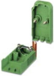
Cable housing, pitch: 0 mm, number of positions: 5, dimension a: 39.9 mm, color: green

Please be informed that the data shown in this PDF Document is generated from our Online Catalog. Please find the complete data in the user's documentation. Our General Terms of Use for Downloads are valid ( http://phoenixcontact.com/download )