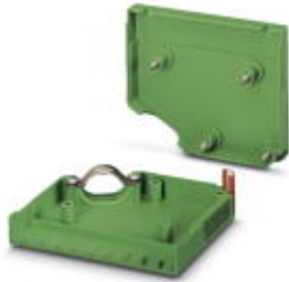
Cable housing, pitch: 0 mm, number of positions: 6, dimension a: 47.52 mm, color: green

Please be informed that the data shown in this PDF Document is generated from our Online Catalog. Please find the complete data in the user's documentation. Our General Terms of Use for Downloads are valid ( http://phoenixcontact.com/download )