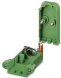
Cable housing, Pitch: 0 mm, Number of positions: 4, Dimension a: 32.28 mm, Color: green

Please be informed that the data shown in this PDF Document is generated from our Online Catalog. Please find the complete data in the user's documentation. Our General Terms of Use for Downloads are valid ( http://download.phoenixcontact.com )