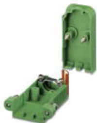
Cable housing, pitch: 0 mm, number of positions: 5, dimension a: 39.9 mm, color: green

Please be informed that the data shown in this PDF Document is generated from our Online Catalog. Please find the complete data in the user's documentation. Our General Terms of Use for Downloads are valid ( http://phoenixcontact.com/download )