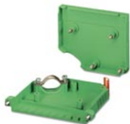
Cable housing, pitch: 0 mm, number of positions: 9, dimension a: 70.98 mm, color: green

Please be informed that the data shown in this PDF Document is generated from our Online Catalog. Please find the complete data in the user's documentation. Our General Terms of Use for Downloads are valid ( http://phoenixcontact.com/download )