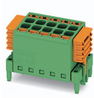
The illustration shows the 5-pos. version

Plug component, Push-in spring connection