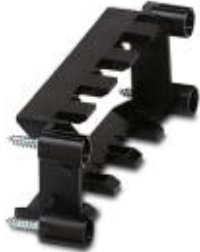
Sleeve frame, without PE, for contact insert modules, type 4, number of insert modules 5

Please be informed that the data shown in this PDF Document is generated from our Online Catalog. Please find the complete data in the user's documentation. Our General Terms of Use for Downloads are valid ( http://download.phoenixcontact.com )