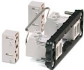
Panel mounting frame, with capacitive PE, for contact insert modules, type 4, number of insert modules 5

Please be informed that the data shown in this PDF Document is generated from our Online Catalog. Please find the complete data in the user's documentation. Our General Terms of Use for Downloads are valid ( http://phoenixcontact.com/download )