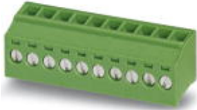
The figure shows a 10-position version of the product

PC terminal block, Nominal current: 12 A, Nom. voltage: 160 V, Pitch: 3.5 mm, Number of positions: 2, Connection method: Screw connection, Mounting: Soldering, Conductor/PCB connection direction: 90 °, Color: green