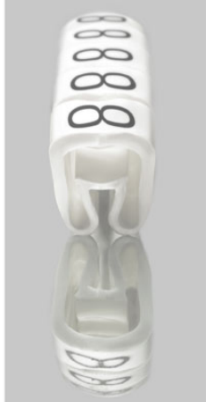
Product is similar to illustration