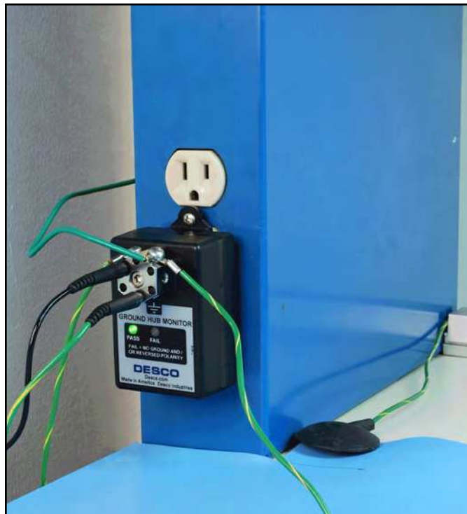
Figure 6. Ground Hub Continuous Monitor in-use photo