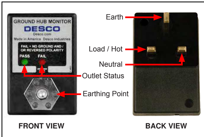
Figure 4. Desco 19224 Ground Hub Continuous Monitor features and components