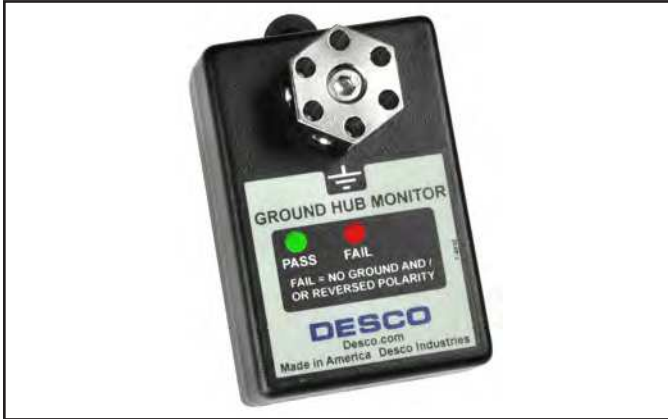
Figure 1. Desco 19219 Ground Hub Continuous Monitor