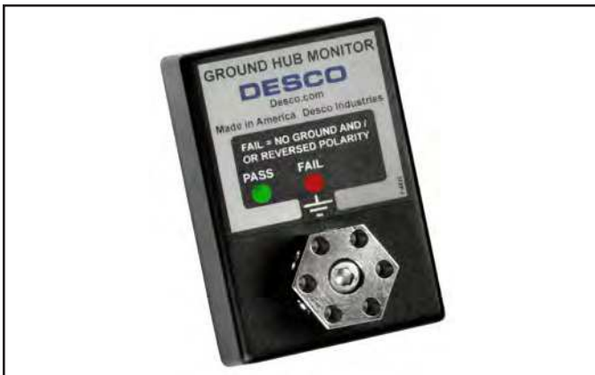
Figure 2. Desco 19224 Ground Hub Continuous Monitor