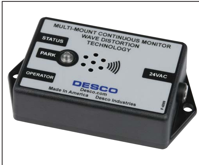
Figure 1. Desco Multi-Mount Continuous Monitor.