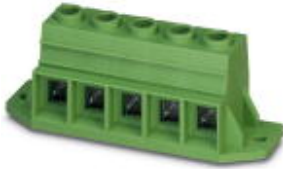
The figure shows a 5-pos. version of the product

Please be informed that the data shown in this PDF Document is generated from our Online Catalog. Please find the complete data in the user's documentation. Our General Terms of Use for Downloads are valid ( http://download.phoenixcontact.com )