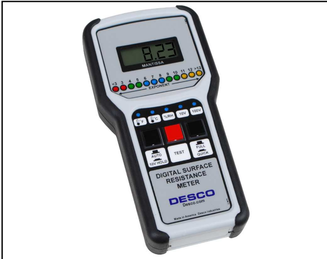
Figure 3. Desco 19788 Digital Surface Resistance Meter