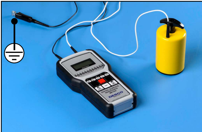
Figure 5. Rtg test setup

If the measurement is outside acceptable limits, clean the surface with an ESD cleaner containing no insulative silicone such as Reztore™ Antistatic Surface & Mat Cleaner , and re-test to determine if the cause of failure is an insulative dirt layer or the ESD worksurface material.