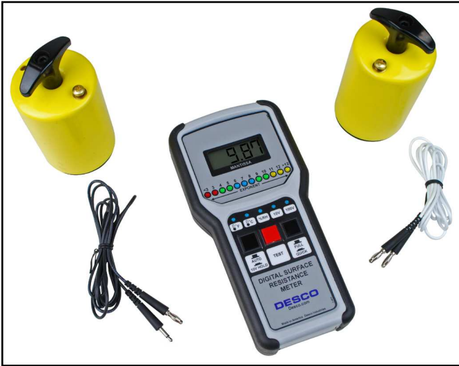
Figure 1. Desco Digital Surface Resistance Meter Kit