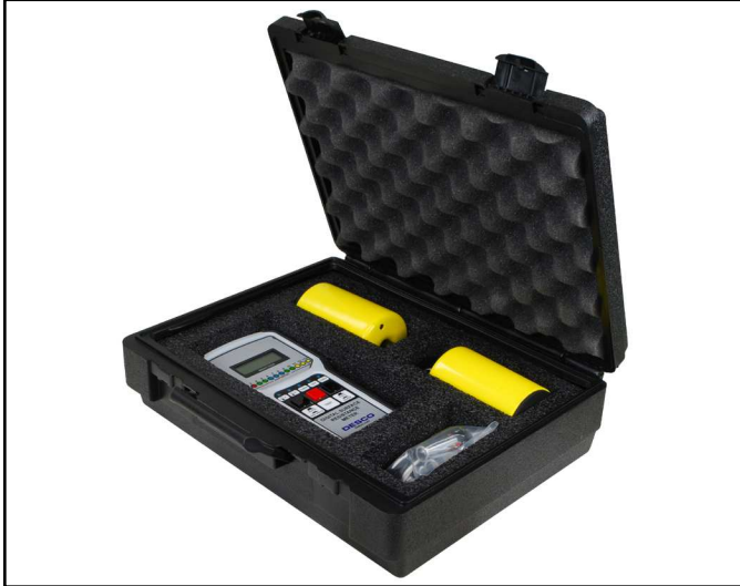
Figure 2. Desco 19787 Digital Surface Resistance Meter Kit