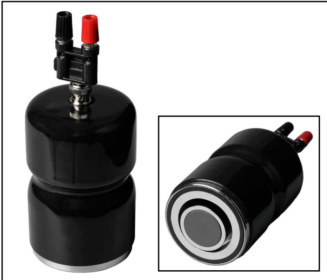
Figure 7. Desco 50005 Concentric Ring Probe

The Desco 50005 Concentric Ring Probe is an instrument to be used in conjunction with a resistance meter, such as the Desco 19787 Digital Surface Resistance Meter, to measure surface resistance per ANSI/ESD STM11.11 the test method listed in Packaging standard ANSI/ESD S541 for surface resistance of planar materials.