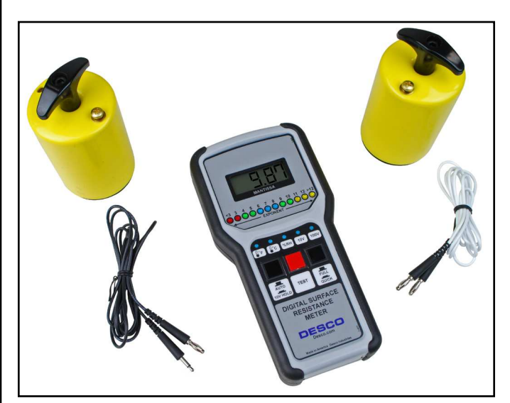
Figure 1. Desco Digital Surface Resistance Meter Kit