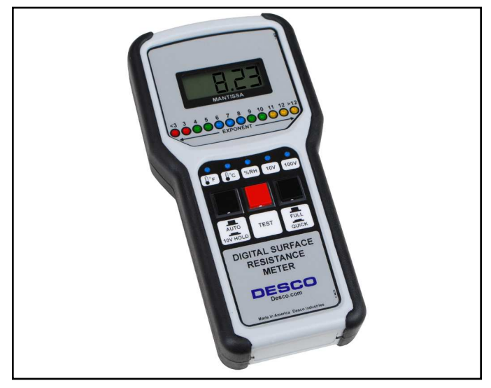
Figure 3. Desco <u>19788</u> Digital Surface Resistance Meter