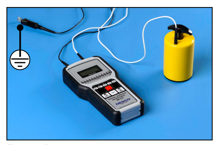
Figure 5. Rtg test setup

If the measurement is outside acceptable limits, clean the surface with an ESD cleaner containing no insulative silicone such as Reztore™ Antistatic Surface & Mat Cleaner, and re-test to determine if the cause of failure is an insulative dirt layer or the ESD worksurface material.