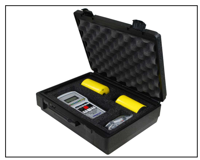
Figure 2. Desco <u>19787</u> Digital Surface Resistance Meter Kit