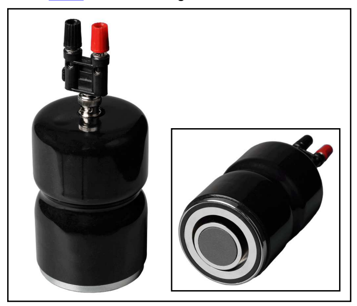
Figure 7. Desco 50005 Concentric Ring Probe

The Desco 50005 Concentric Ring Probe is an instrument to be used in conjunction with a resistance meter, such as the Desco 19787 Digital Surface Resistance Meter, to measure surface resistance per ANSI/ESD STM11.11 the test method listed in Packaging standard ANSI/ESD S541 for surface resistance of planar materials.