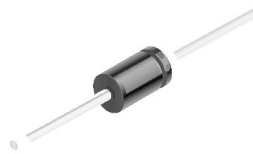
DO-41 Glass case COLOR BAND DENOTES CATHODE