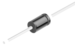
DO-35 Glass case COLOR BAND DENOTES CATHODE