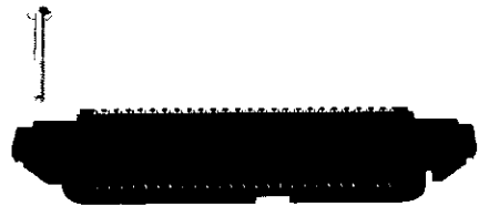
Screw Lock Hardware Kit Part No. 229911-1 (Two required per assembly)

Only fastening hardware supplied, other items shown for reference purposes.