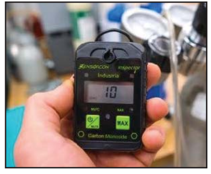
Wait for the countdown to complete.