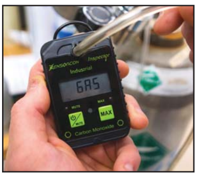
Connect the 50ppm calibration gas.