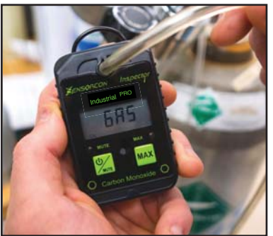
Connect the 50ppm calibration gas.