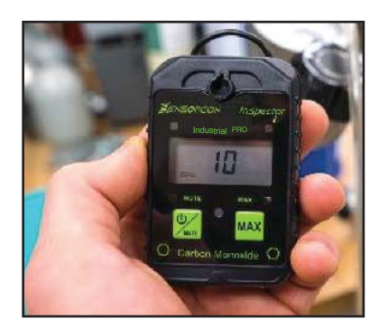
Wait for the countdown to complete.