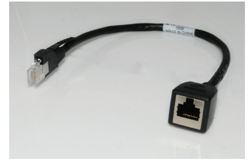
RJ point five Coupler PN 2159658-*