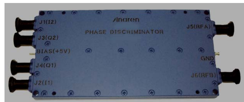
Electrical and Mechanical Specifications subject to change without notice.