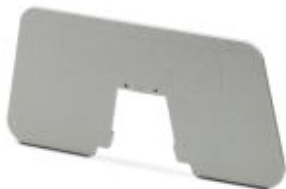
The figure shows the product version UHV-TP 1

Separating plate, width: 2 mm, height: 68.3 mm, color: gray