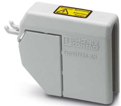
Illustration shows the product version UHV 25-AH

http://eshop.phoenixcontact.de/phoenix/treeViewClick.do?UID=2130444