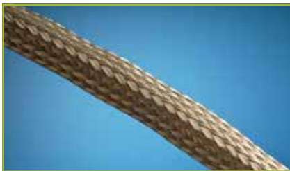
Tinned Copper Braid