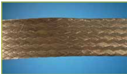
Tinned Copper Braid

See all of our FIT wire management sleeving and copper braid: www.alphawire.com/FIT