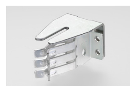
Reference Part Number* 213647-1