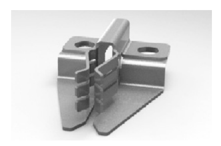
Reference Part Number* 104502-1