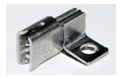
Reference Part Number* 104729-1