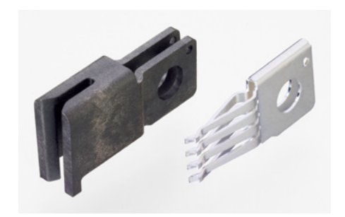
Reference Part Number* 104742-2