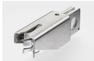
Reference Part Number* 104501-1