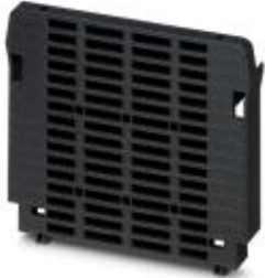
Panel mounting base, Color: black

Please be informed that the data shown in this PDF Document is generated from our Online Catalog. Please find the complete data in the user's documentation. Our General Terms of Use for Downloads are valid ( http://phoenixcontact.com/download )