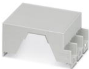
Component housing, length: 99 mm, Upper part, color: light gray, width: 67.5 mm, height: 38.5 mm

Please be informed that the data shown in this PDF Document is generated from our Online Catalog. Please find the complete data in the user's documentation. Our General Terms of Use for Downloads are valid ( http://phoenixcontact.com/download )